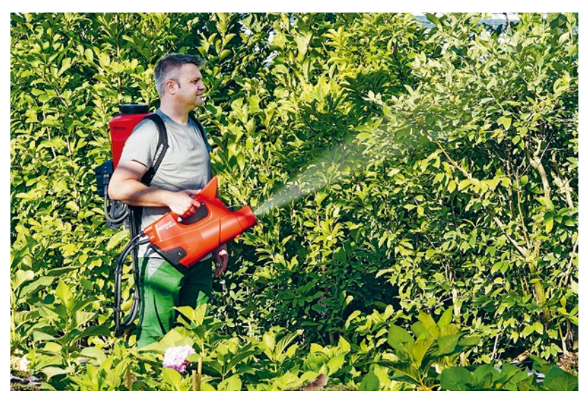
Successfully supported: Birchmeier Sprühtechnik AG in Stetten developed a modern spraying technique for the protection of plants and pest control. This project was supported by Aargau Research Fund in collaboration with Hightech Zentrum Aargau. The company has already won several innovation prizes for the electronically controlled spraying technique.

The Aargau Research Fund, together with Hightech Zentrum Aargau's feasibility study and the Nano-Aargovia program, is significantly instrumental in the financing of research and development projects. The Aargau Research Fund supports applied research and development projects from Aargau companies, provided a university or research institute is involved. The projects need to be able to demonstrate a high level of innovation whilst promising economic gains to the business partner. The amount for sponsorship, a maximum of 100,000 SF comes from the university or research institute involved. The company matches the amount with their own personal contribution.