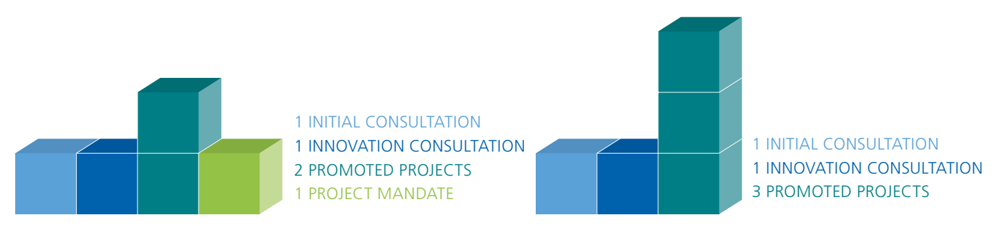
Depending on requirement the selection of service components can be varied. Several promoted projects per field are possible.

Aargau SMEs are promoted financially in components 1 to 3 with a considerable amount.